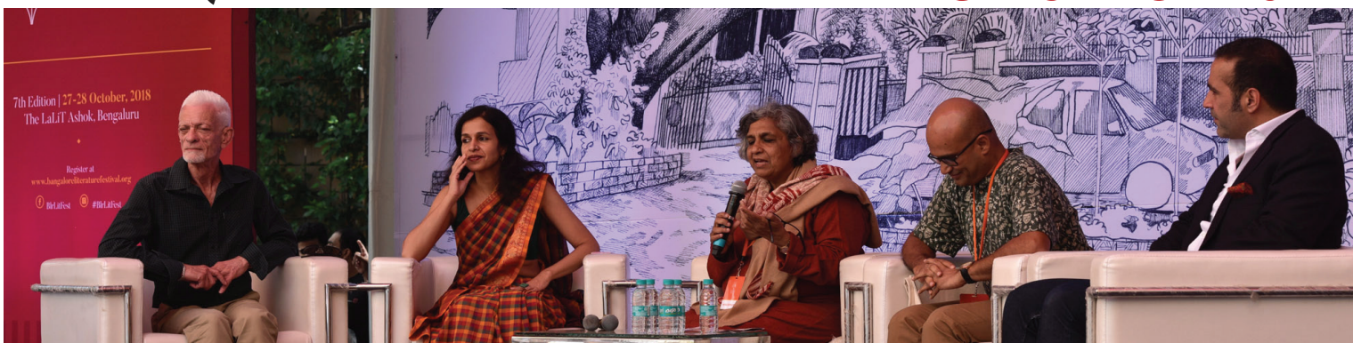
PANELISTS DISCUSS SEC 377 AT BANGALORE LIT FEST