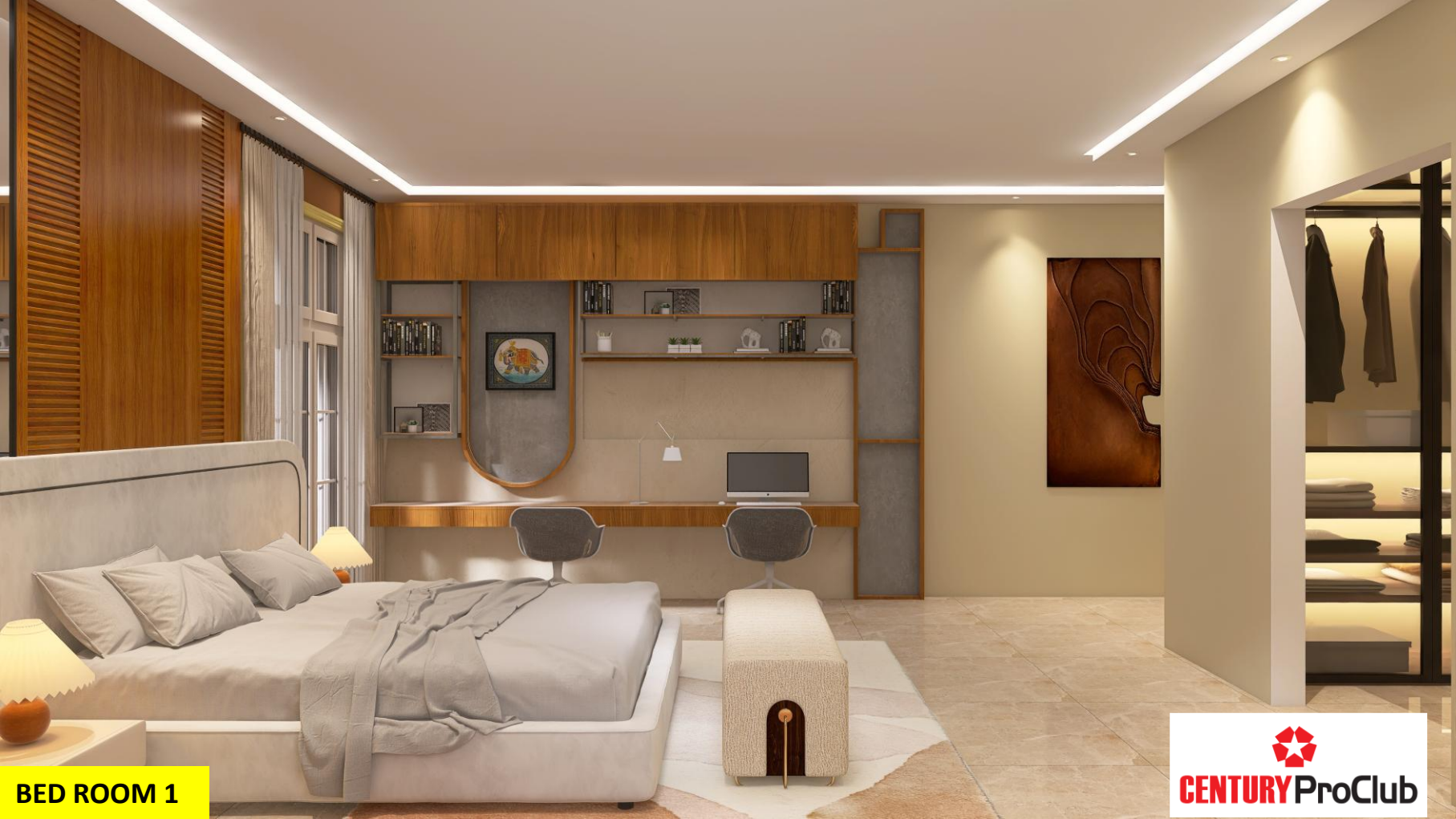
BED ROOM 1