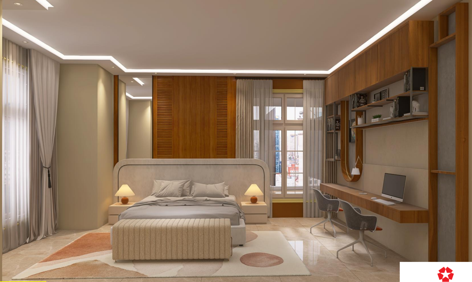
BED ROOM 1