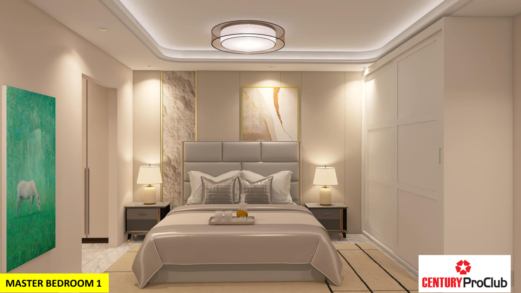
MASTER BEDROOM 1