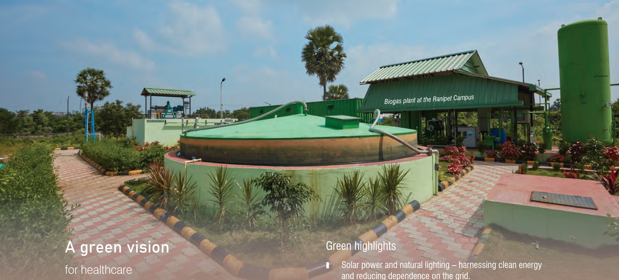
Biogas plant at the Ranipet Campus