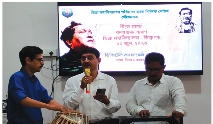
Bishnu Rabha Divas 2023