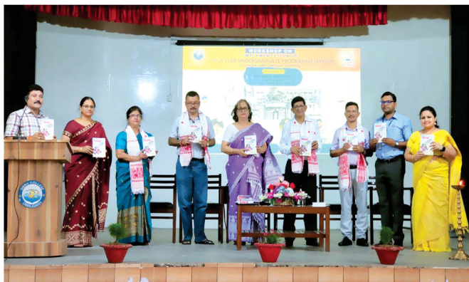
Workshop on Implementation of FYUGP & Inauguration of Edited Book PRISM on Multi Disciplinary Research