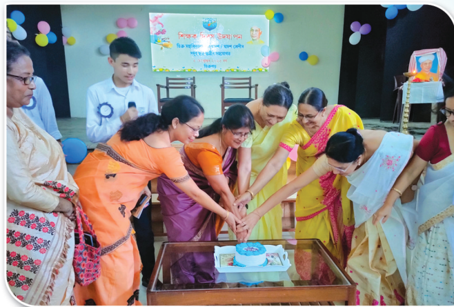
Teacher's Day 2023