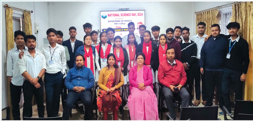
National Science Day 2024 Celebration