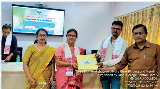
Three Day Workshop on Library Book Binding & Mending