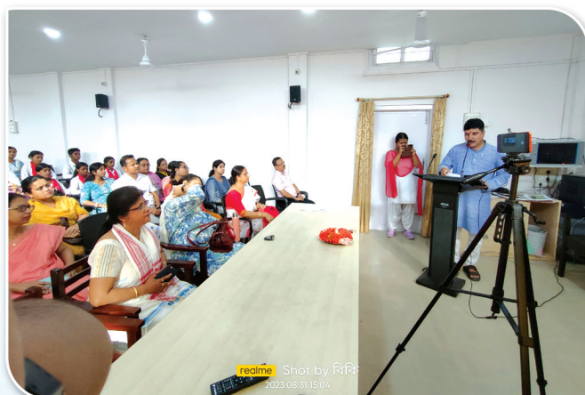
One Week Workshop on Brahmilipi