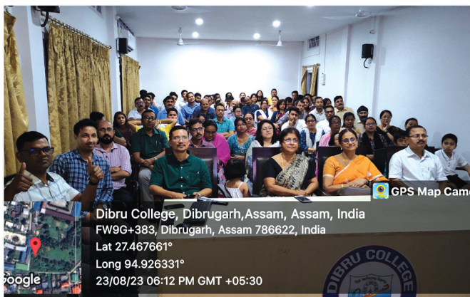
Live telecast of Chandrayan-3 Landing