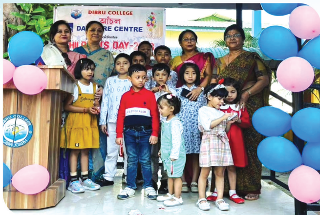
Children's Day celebration 2023