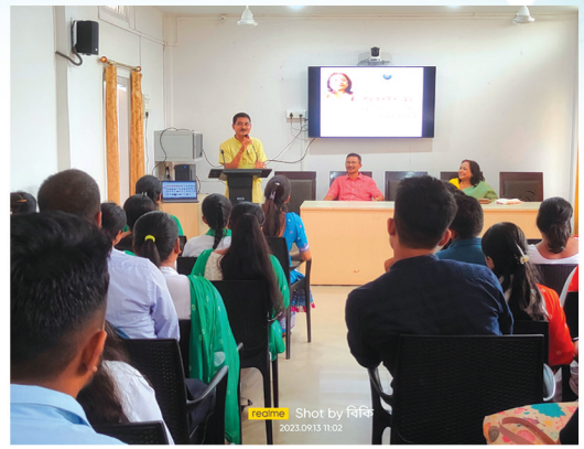
Comparative Study of Assamese & Bengali Literature