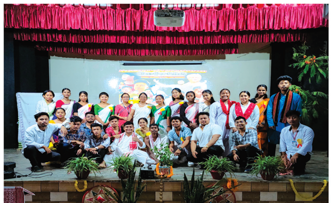
Awareness Camping in the form of Drama