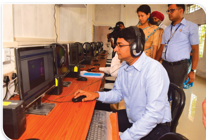
NAAC Peer Team visit to Language Lab