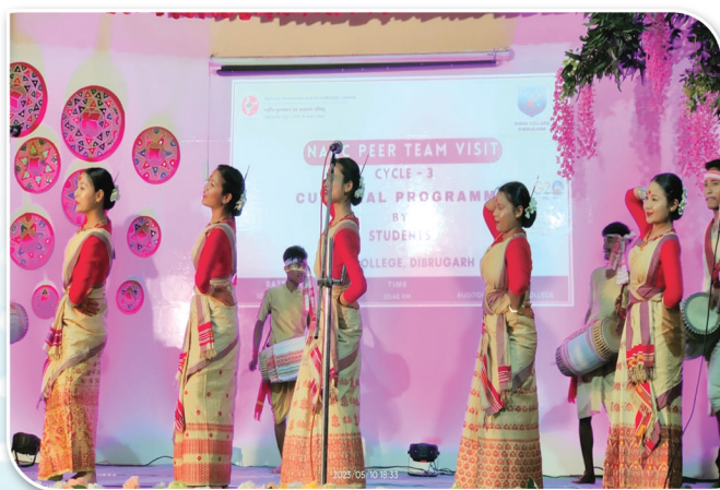
Bihu performance during NAAC visit 2023