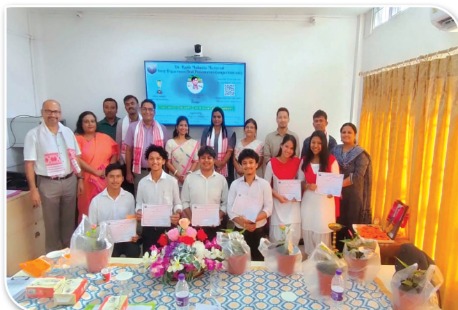
Winners of Dr. Rajib Mahanta Memorial Inter Department Oral Presentation Competition 2023