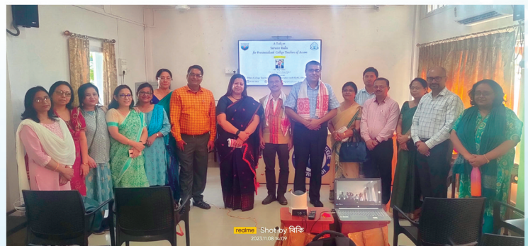
Talk on Service Rules for Provincialised College Teachers of Assam