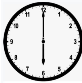
6 o' clock