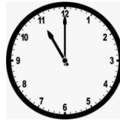
11 o' clock