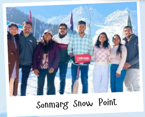
Sonmarg Snow Point

✓ Snow Point 🍽️ Breakfast, Lunch & Dinner