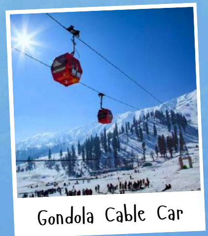
Gondola Cable Car