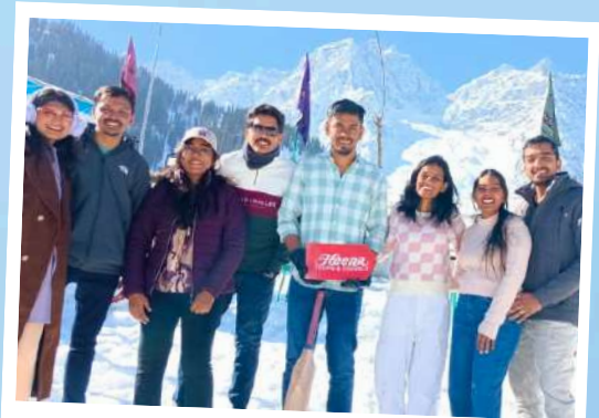
Sonmarg Snow Point

✓ Snow Point 🍽️ Breakfast, Lunch & Dinner