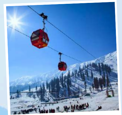
Gondola Cable Car

✓ Gulmarg Snow point [tickets not included in cost] 🍽️ Breakfast, Lunch & Dinner