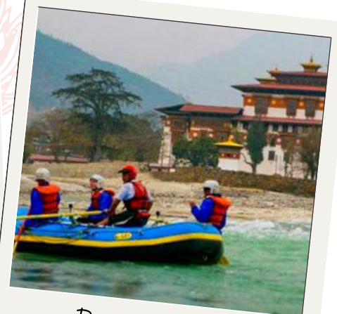
River Rafting at Punakha