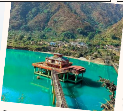
Dhari Devi Temple