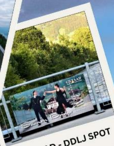
GSTAAD - DDLJ SPOT