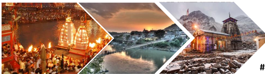
HARI KI PAURI - HARIDWAR