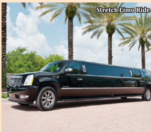
Stretch Limo Ride