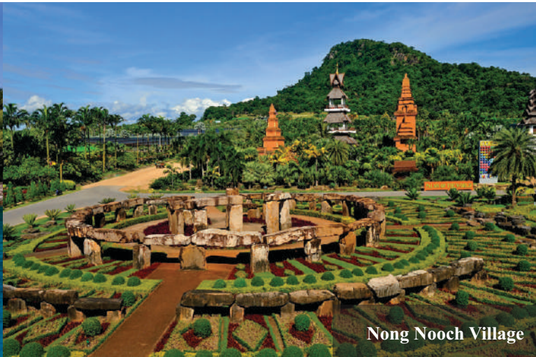
Nong Nooch Village