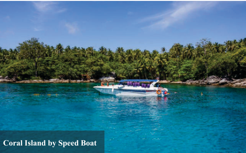
Coral Island by Speed Boat

After breakfast full day free for shopping / rest. Enjoy Lunch & Dinner prepared by Heena's Rajasthani Maharaj. Overnight at hotel. Breakfast ✓ Lunch ✓ Dinner ✓