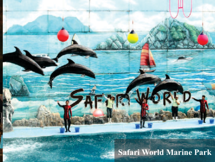
Safari World Marine Park