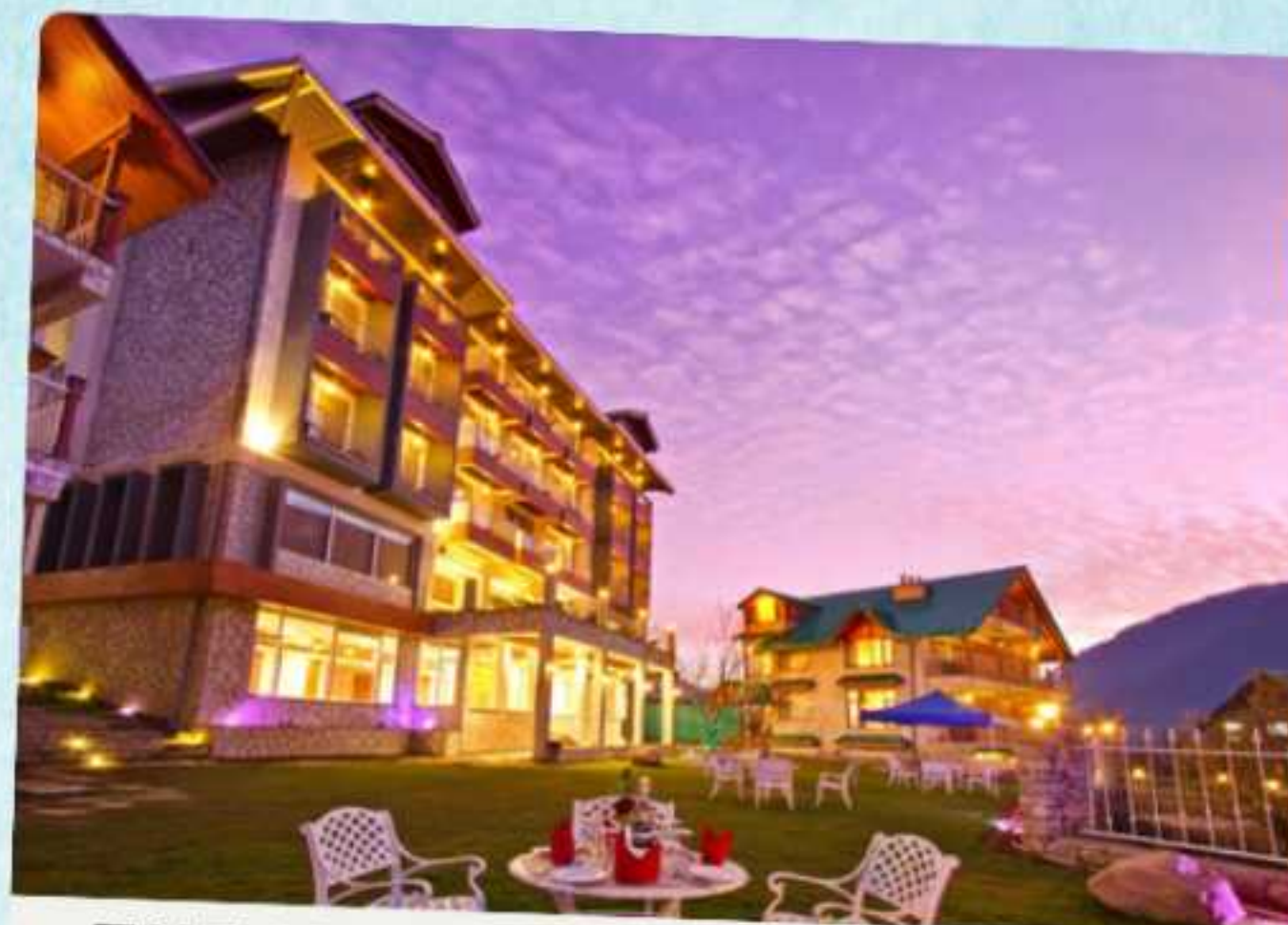
THE WHITESTONE RESORTS, MANALI