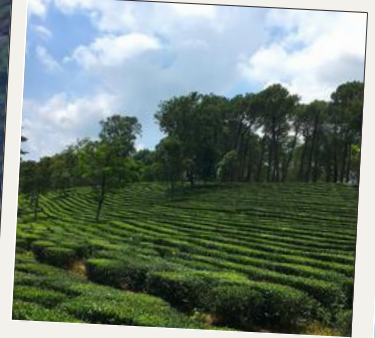
Himalayan Tree Garden