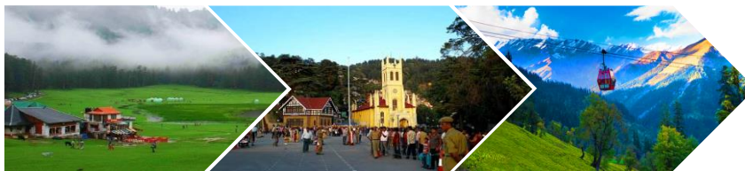
KHAJJIAR MINI SWISS