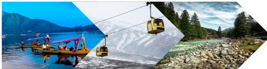
DAL LAKE SRINAGAR