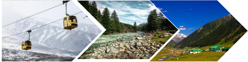
GONDOLA CABLE GULMARG PAHALGAM VIEW SONMARG VIEW