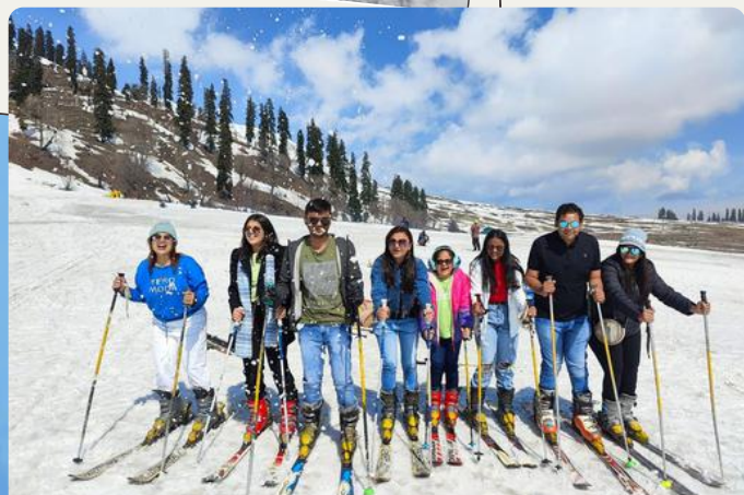
GUEST IN GULMARG