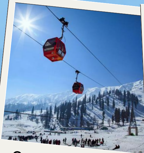
Gondola Cable Car

*If roads from Srinagar to Sonmarg are closed due to heavy snowfall, then you will be provided accommodation in Srinagar (instead of Sonmarg)