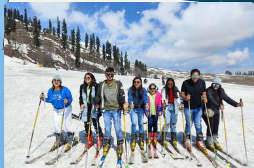
GUEST SKIING IN GULMARG