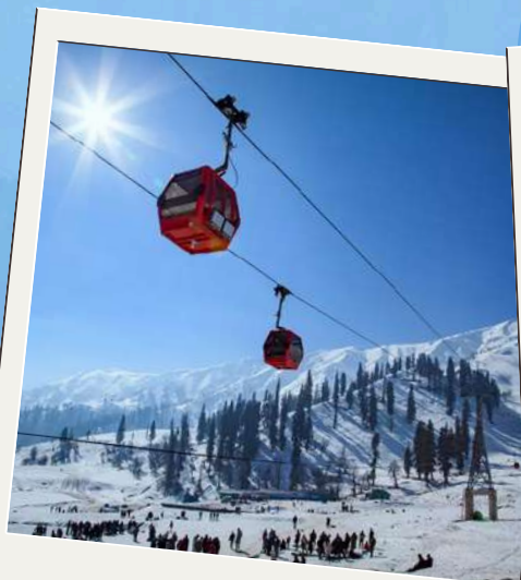
Gondola Cable Car

*If roads from Srinagar to Sonmarg are closed due to heavy snowfall, then you will be provided accommodation in Srinagar (instead of Sonmarg)