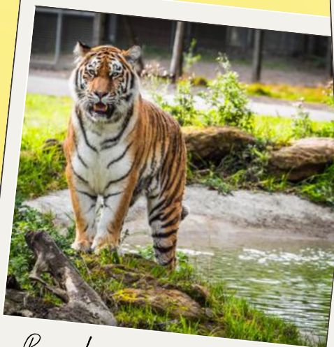
Bandipur National Park