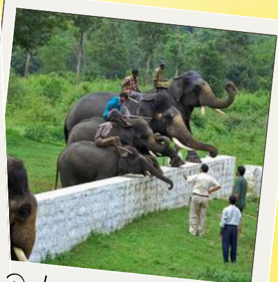
Dubare Elephant camp