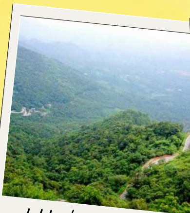
Lakkidi View point