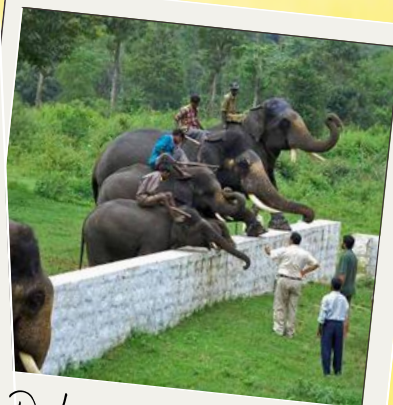
Dubare Elephant camp