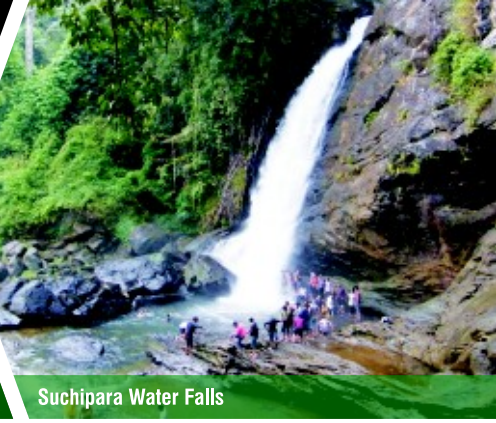
Suchipara Water Falls