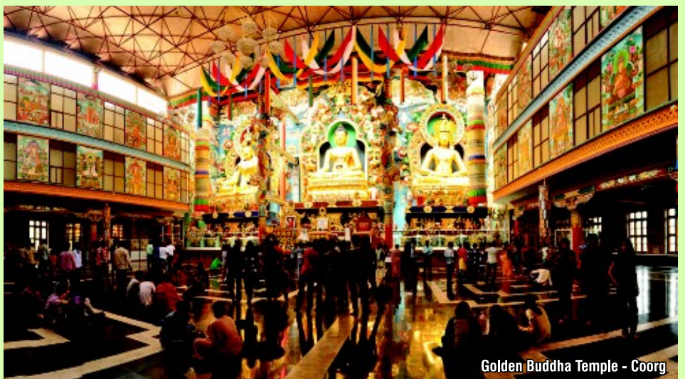
Golden Buddha Temple - Coorg

Note: This tour starts with Lunch on Day-1 and concludes with Breakfast on Day-8.