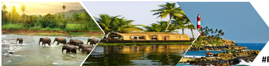
WILD LIFE - THEKKADY