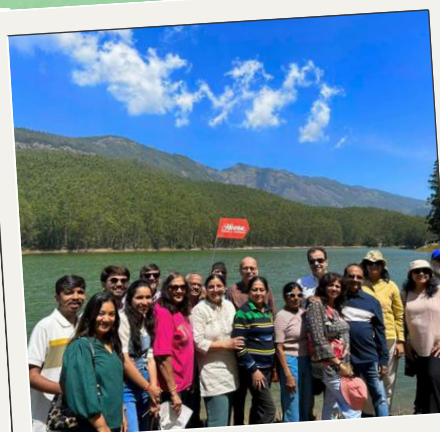
Guest enjoying at Madupatty Dam