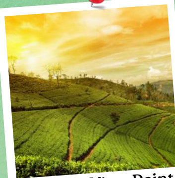
Rajmala View Point

After breakfast visit Metupatty Dam for Speed boating (included in the cost), Rose Garden & Botanical Garden . Evening free for leisure/rest or Shopping. Dinner & Night halt at Munnar