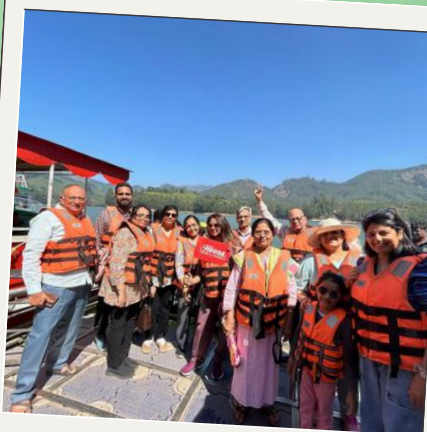
Guests enjoying Boating

*Kumarakom - Abad Whispering Palms – Room Upgradation (Lake Facing) will be Charged @Rs.4000 / - Per Room for 2 Nights