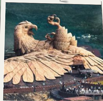
Jatayu Earth Centre

After breakfast, check out from the hotel with your luggage and proceed to Trivandrum; it is famous for its beaches, among the most pristine in India. It is extremely popular among Westerners due to shallow waters and low tidal waves. En route, visit Jatayu Earth Centre . It is home to the world's largest bird sculpture (included in the cost), and then proceed to Trivandrum. Dinner and night halt at Trivandrum.