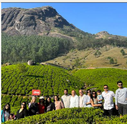
Guests at Tea Garden