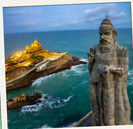
Vivekananda Rock Memorial/ Thiruvalluvar Statue