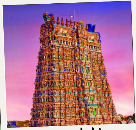
Meenakshi Sundareswarar Temple