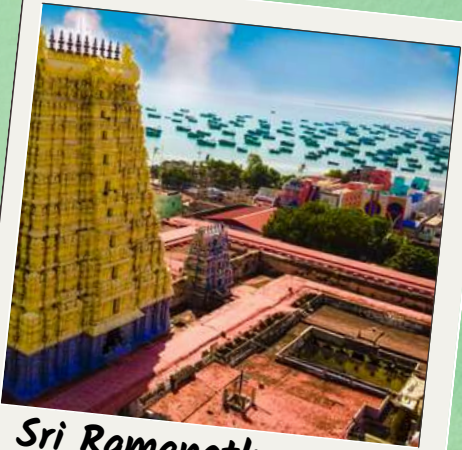
Sri Ramanathaswamy Temple