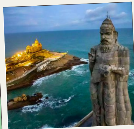
Vivekananda Rock Memorial/ Thiruvalluvar Statue