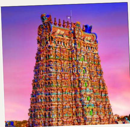
Meenakshi Sundereswarar Temple