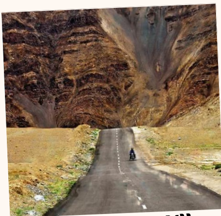
Magnetic Hill Point