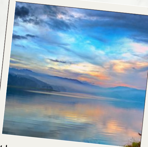
Umiyam Lake / Barapani