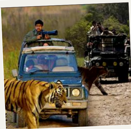
Kaziranga National Park