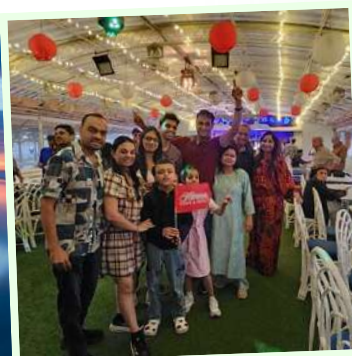
Guest on Cruise

✓ Maa Kamakhya temple ✓ River Cruise 🕒 Lunch & Dinner