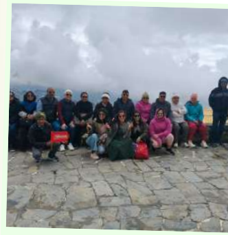
Tawang View Point