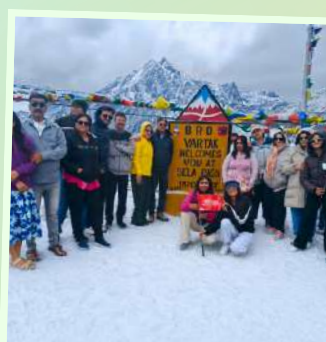
Guest in Sela Pass

After breakfast, check out from the hotel and proceed to Tawang (10,000 ft). On the way, you will pass through the picturesque Dirang Valley , known for its monasteries, apple and kiwi orchards, sheep breeding farms, and charming valleys. Witness the snowcapped Sela Pass at 13,700 ft and the Jaswant Garh War Memorial . Upon arrival, check into your hotel. Dinner and overnight stay in Tawang.