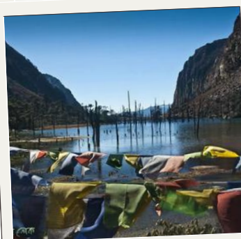
The Sangestor Lake