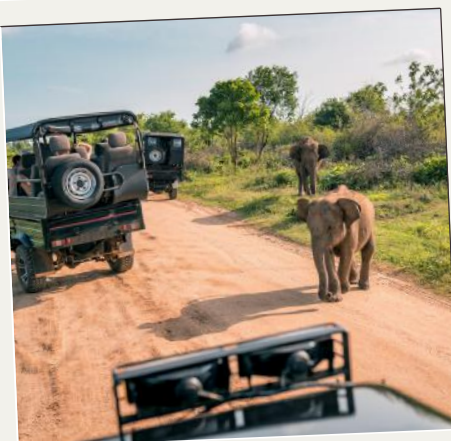
Corbett Jungle Safari