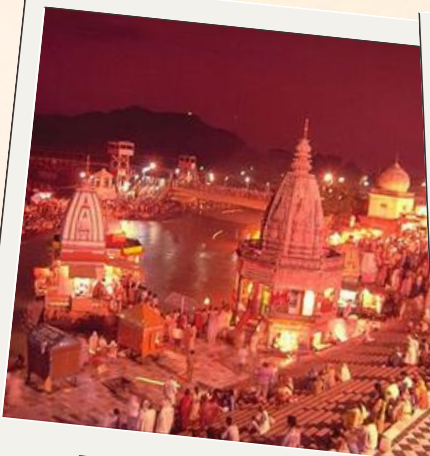
Har ki Parvi