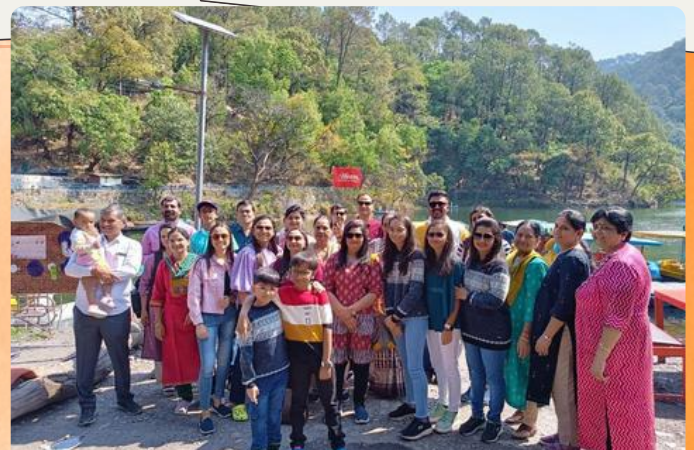
GUEST AT NAINITAL LAKE