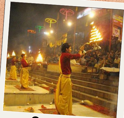
Ganga Aarti Janakpur

After breakfast, check out from the hotel at around 8am. We then leave for Janakpur. Janakpur, the birthplace of Goddess Sita, is a vibrant city known for the iconic Janaki Temple, rich Mithila culture, and colorful festivals. A sacred destination for spiritual and cultural exploration. After reaching Janakpur we visit - Janaki Temple, Vivah Mandap and Aarti Of Ganga. Dinner & Night Stay at Janakpur.