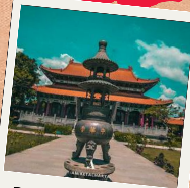
Dae Sung Shakya