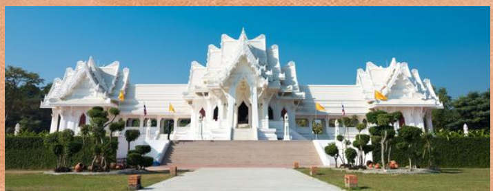
Royal Thai Monastery – Lumbini