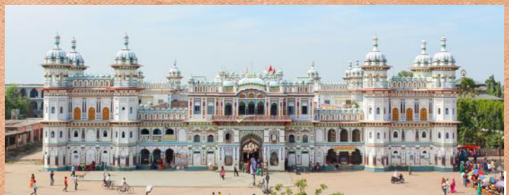
Janaki Temple – Janakpur