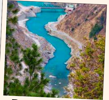
Baspa Reservoir view point

Enroute we go through the Kinnaur Tunnel and enjoy the beautiful Baspa Reservoir view point & the Sangam of Baspa & Sutlej Rivers . After reaching Sangla, check in, have Lunch and later proceed to visit the Berina temple [Lord Shiva Temple]. Dinner and Night Stay at Sangla.