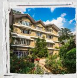
Shimla - Hotel East Bourne