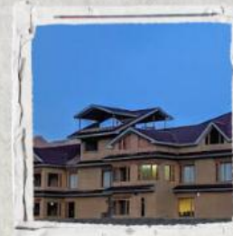
Kaza - Hotel Rongtong