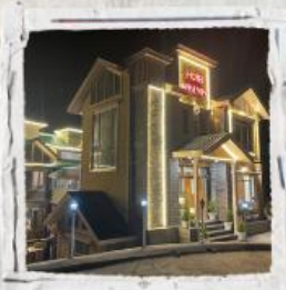
Narkanda -Hotel Apple View

Note: Hotels are subject to change depending on Group Size Room upgrade option available in Sangla - 2000 Rs /Night