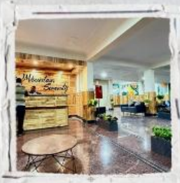
Kalpa - Hotel Mountain Serenity