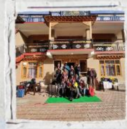
Tabo - Hotel Maitreya Mud