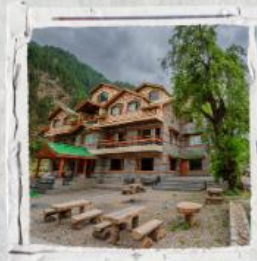
Sangla - Hotel Batseri