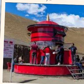
Hikkim Post Office

After breakfast, proceed to Kalpa town, surrounded by the majestic Kinner Kailash mountain range, enroute we visit the Gue Mummy , believed to be the remains of the famous saint Sangha Tenzin over 500 yrs old. After reaching enjoy Dinner at the Kalpa Hotel with a mini theatre experience one of its kind like never before. Night halt at the Kalpa.