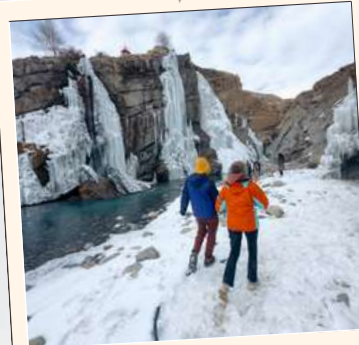
Lingti Frozen Waterfall

Upon reaching Kaza's hotel have your Lunch and rest. Later in the evening we visit Key monastery where we enjoy the Herbal tea made by monks and then visit the famous Chicham bridge , the highest bridge in the Asia , situated at 13,596 ft above sea level. Dinner and night halt at the Kaza hotel.