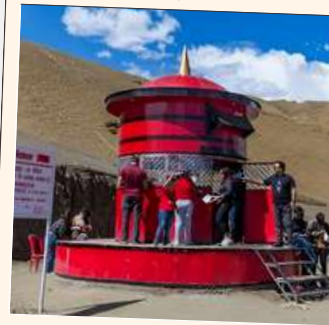
Hikkim Post Office

After Breakfast proceed for the famous sightseeing of: Kibber Village , Langza Village , also known as the fossil village, Hikkim post office , the highest post office in the world, Komic village , the highest village in the world and then return back to hotel. Enjoy your lunch at hotel. Evening free for leisure. Dinner and night halt at the Kaza hotel.