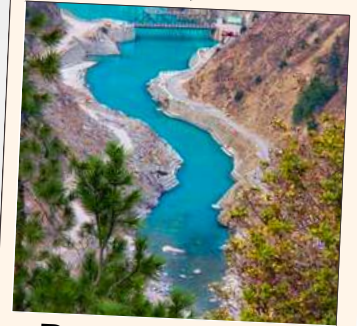
Baspa Reservoir view point

Enroute we go through the Kinnaur Tunnel and enjoy the beautiful Baspa Reservoir view point & the Sangam of Baspa & Sutlej Rivers . After reaching Sangla, check in, have Lunch and later proceed to visit the Bering temple [Lord Shiva Temple]. Dinner and Night Stay at Sangla.