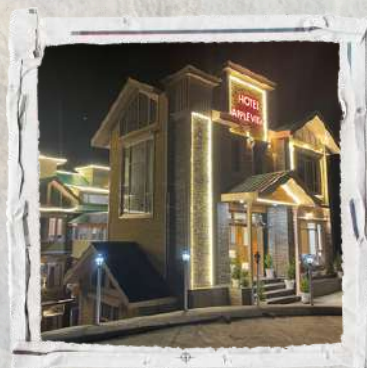
Narkanda -Hotel Apple View

Note: Hotels are subject to change depending on Group Size Room upgrade option available in Sangla - 2000 Rs /Night