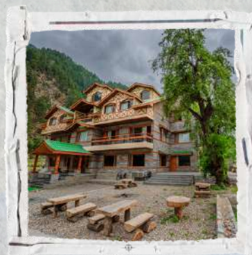
Sangla - Hotel Batseri