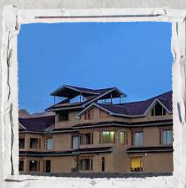
Kaza - Hotel Rongtong