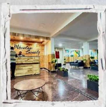
Kalpa - Hotel Mountain Serenity