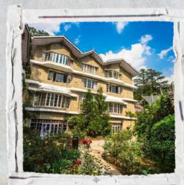
Shimla - Hotel East Bourne