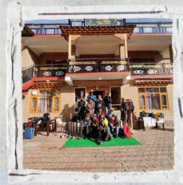
Tabo - Hotel Maitreya Mud