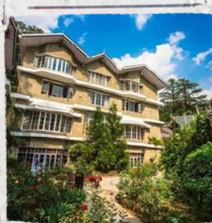
Shimla - Hotel East Bourne