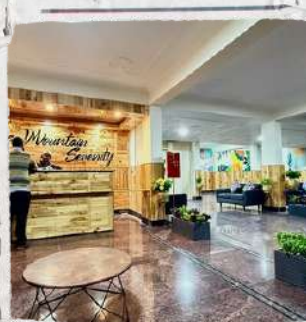
Kalpa - Hotel Mountain Serenity