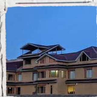
Kaza - Hotel Rongtong