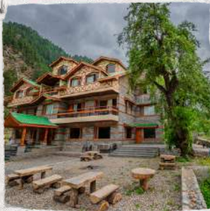
Sangla - Hotel Batseri