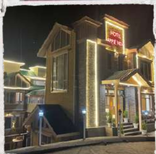
Narkanda -Hotel Apple View

Note: Hotels are subject to change depending on Group Size Room upgrade option available in Sangla - 2000 Rs /Night