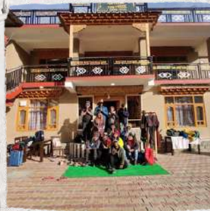
Tabo - Hotel Maitreya Mud