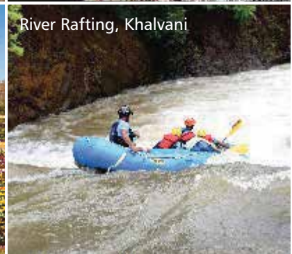
River Rafting, Khalvani