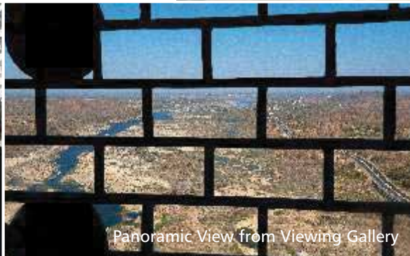
Panoramic View from Viewing Gallery