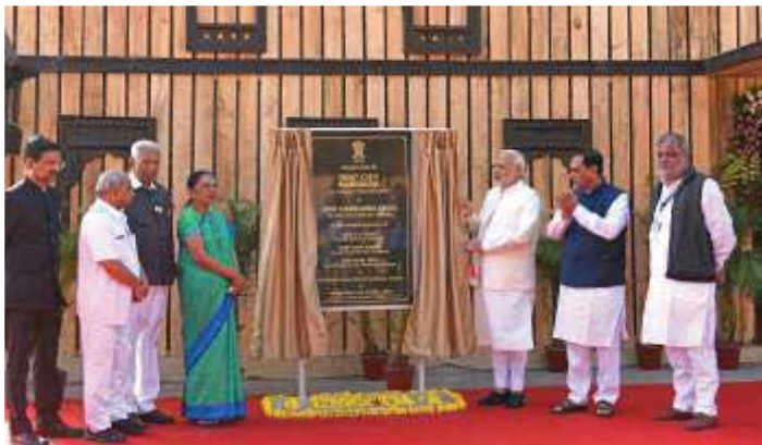
Inauguration of Tent City Narmada by Shri Narendra Modi, Hon'ble Prime Minister of India