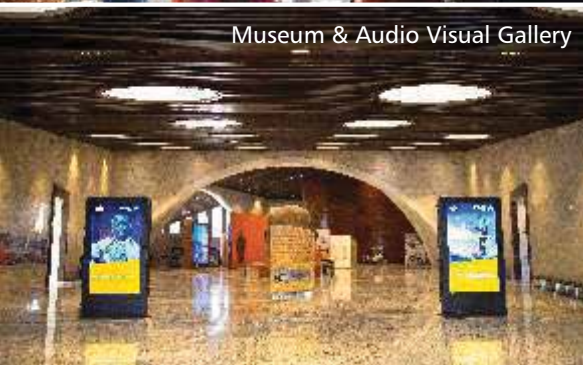
Museum & Audio Visual Gallery