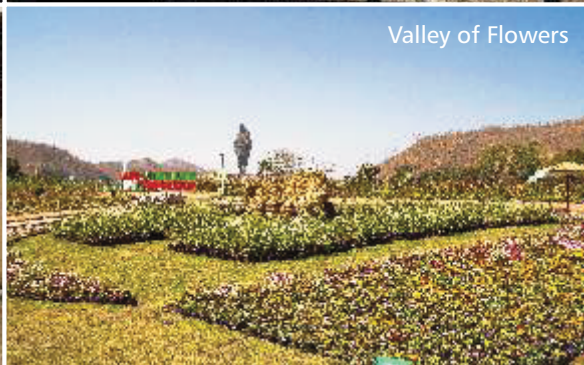
Valley of Flowers