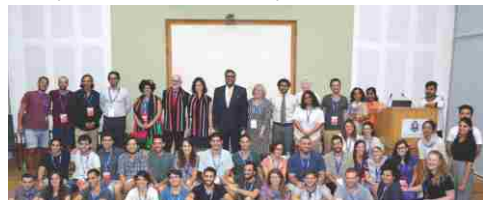
Inaugural Session of 'Jindal Centre for Israel Studies organised Jindal-Shalem English Immersion Programme', 25 July-16 August 2018.