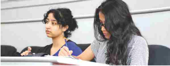
Seminar on 'Career Pathways at JSIA', 20 August 2018.

B.A. (Hons.) (G.A.) students who graduate at the end of 3 years will have a special opportunity to progress directly to JSIA's Masters in Diplomacy, Law and Business - M.A. (DLB) programme, subject to high meritorious academic performance in the B.A. (Hons.) (G.A.). Students can also opt for a second M.A. from Queen Mary University of London, UK; University of Leeds, UK; or University of Warsaw, Poland.