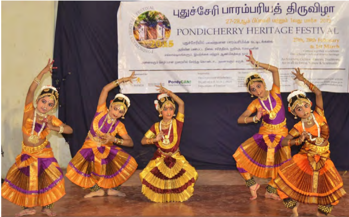
Preserving INTANGIBLE HERITAGE through classical dance forms