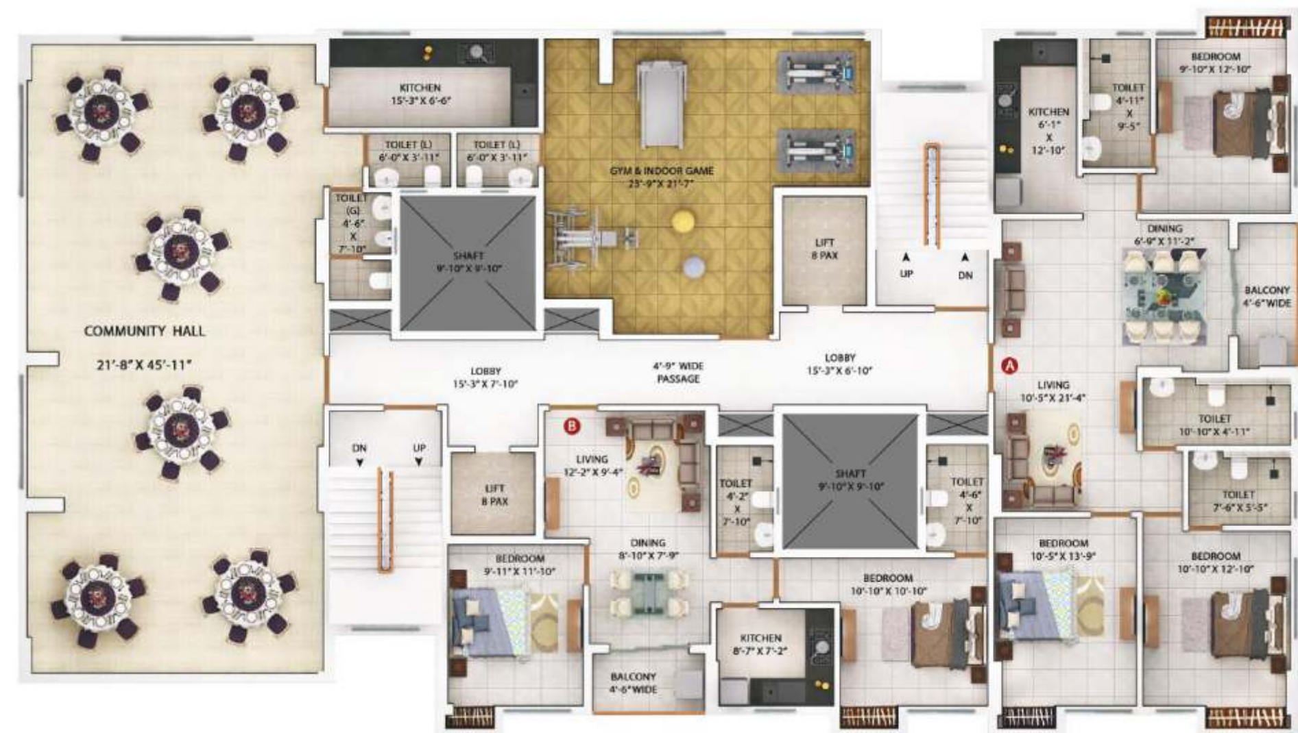
11th floor plan (Area as per WBHIRA)

The dimension shown in the floor plans are shown as estimated. In certain areas the width or length can be reduced, due to service ducts or any other installation as may be required and suggested by architect