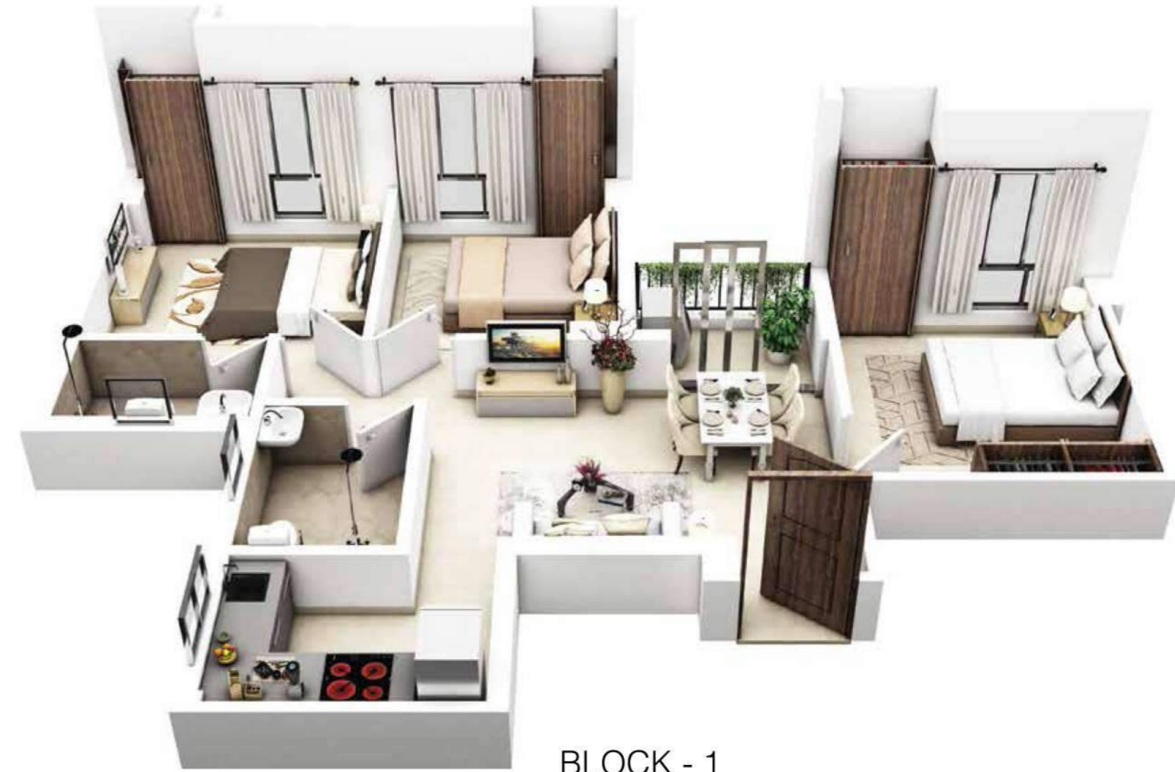
BLOCK - 1 4th to 15th Floor