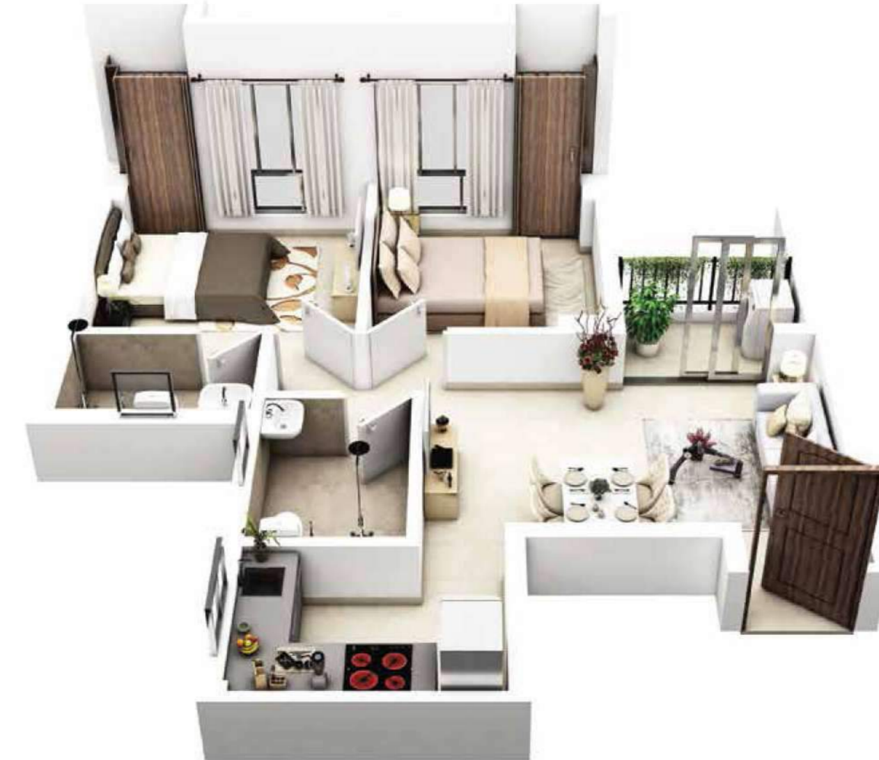
BLOCK - 2 4th to 15th Floor