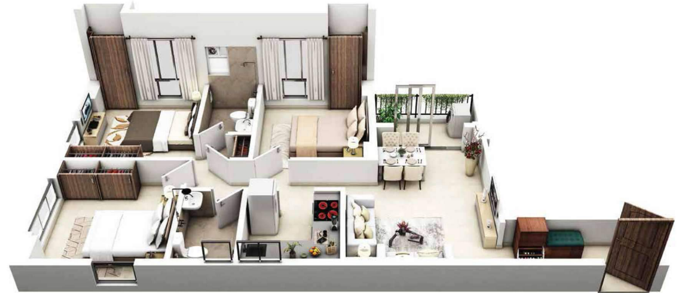
BLOCK - 1 4th to 15th Floor