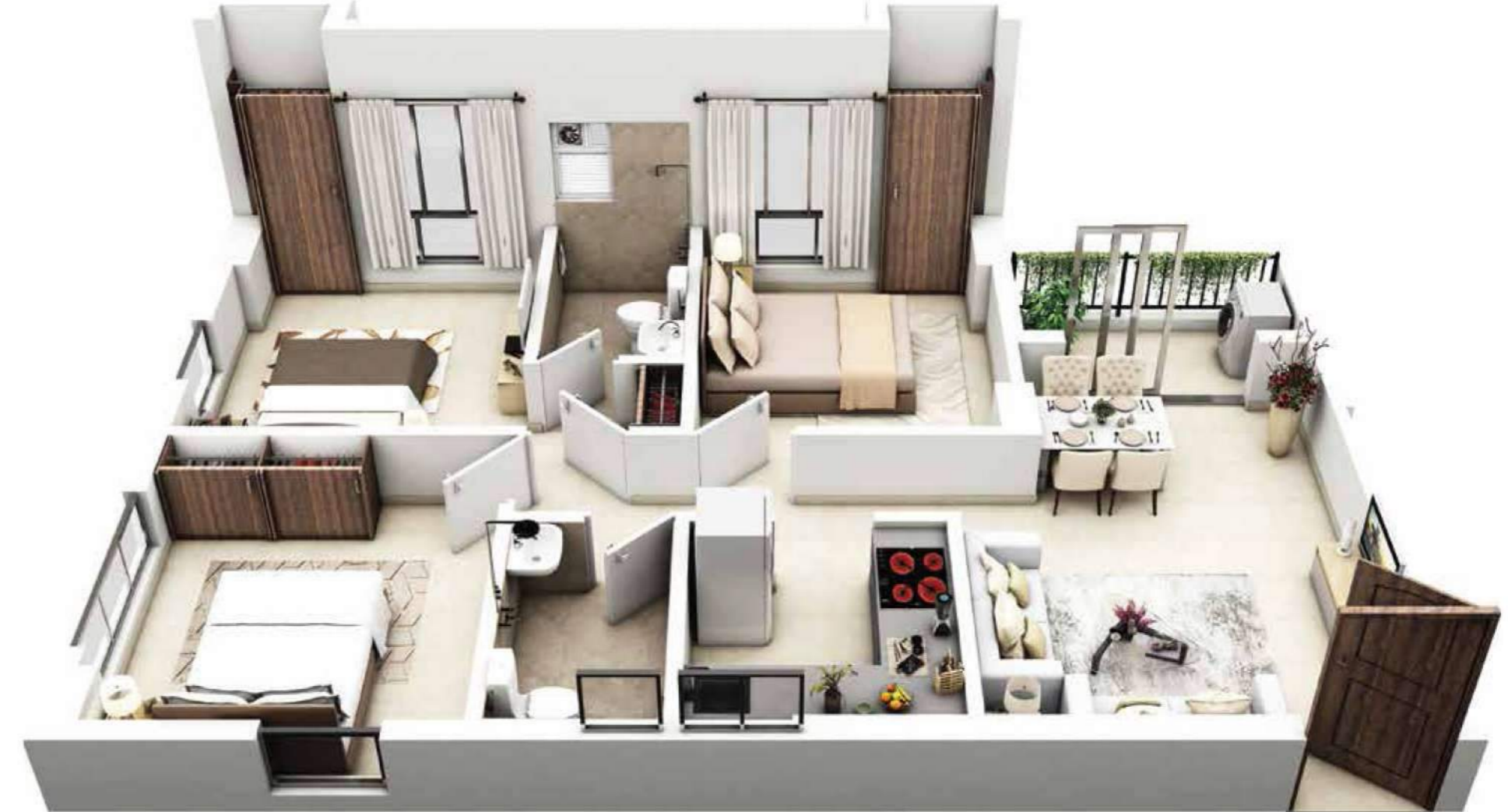
BLOCK - 2 4th to 15th Floor