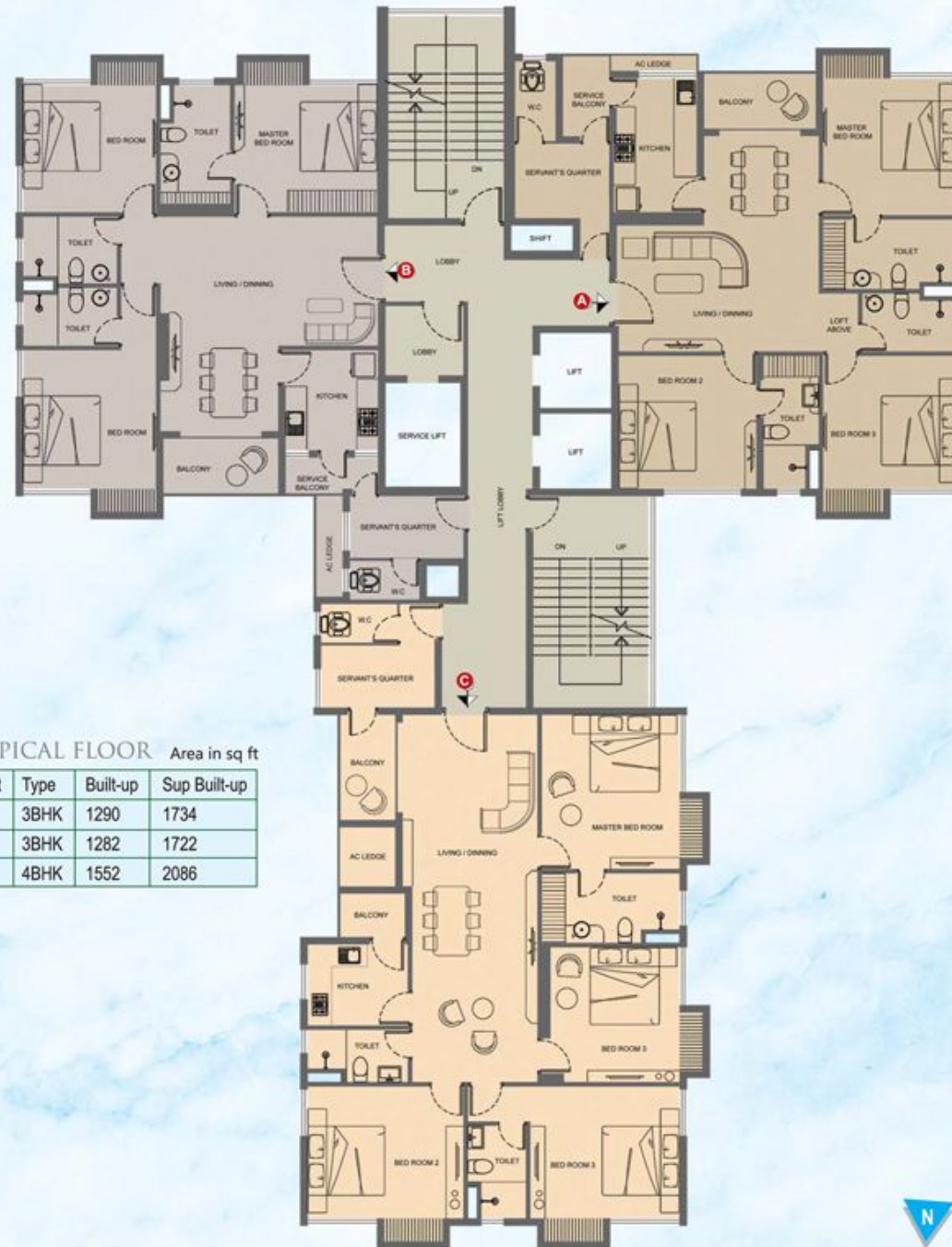
TYPICAL FLOOR Area in sq ft