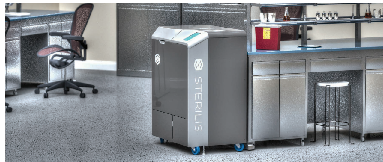
The Sterilis point-of-care system fits into any clinical environment.