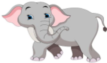
a _____ elephant